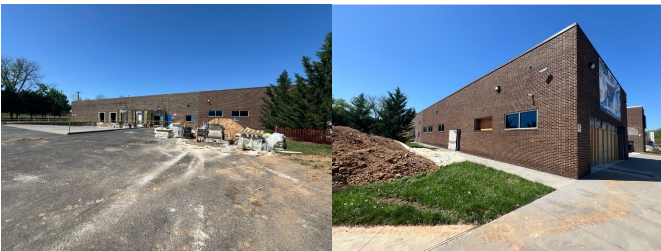
24 th Street (left of tree and right of tree)

Current wall photos (wall repair/construction will be complete prior to start of mural)